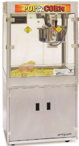
General image shown for reference.